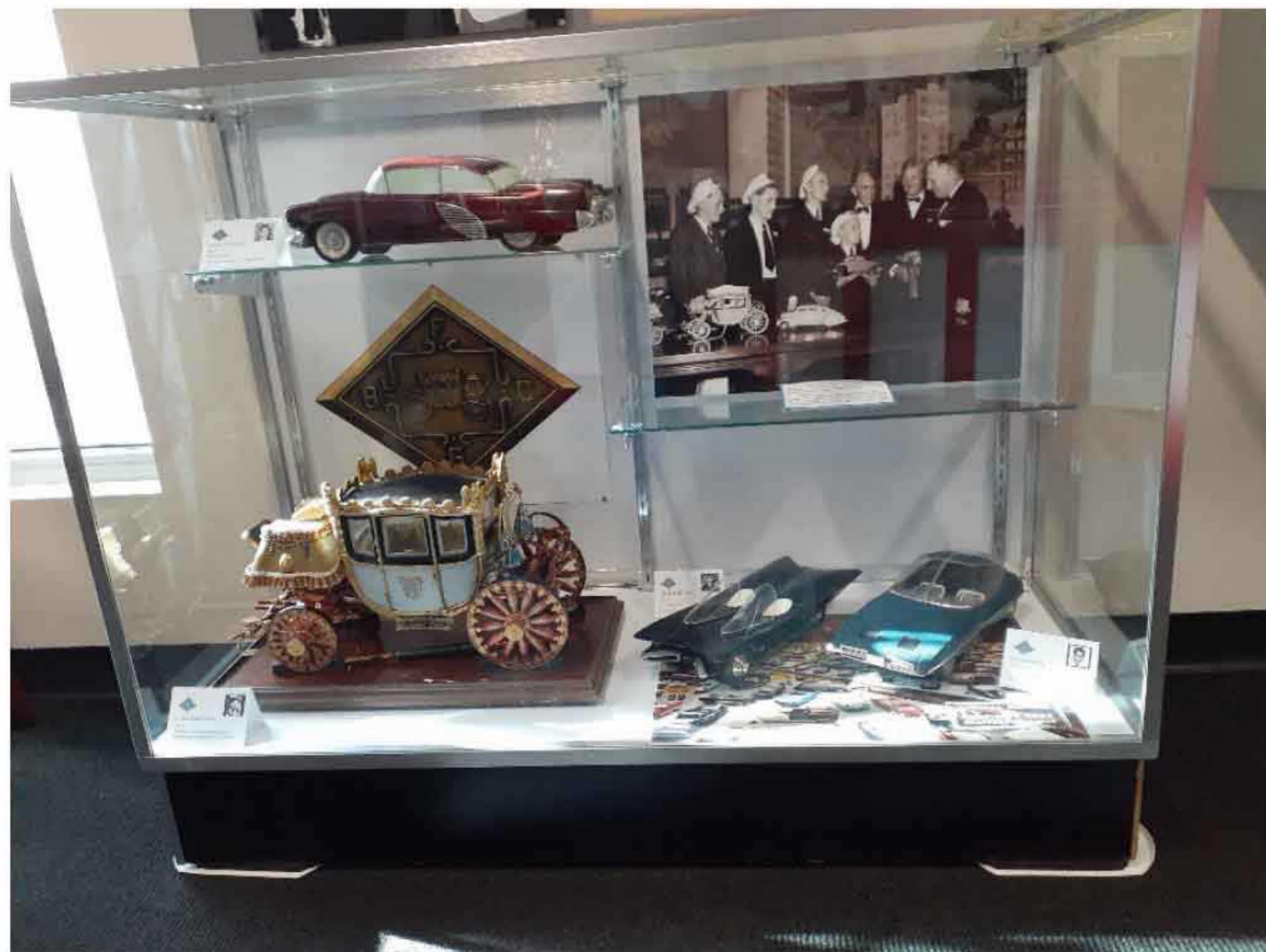
Figure 4. Glass display case with Napoleonic Coach donated by the Radl Family of New Jersey and Gerald Simone's 1958 Styling scholarship winner (black with dual windshields).