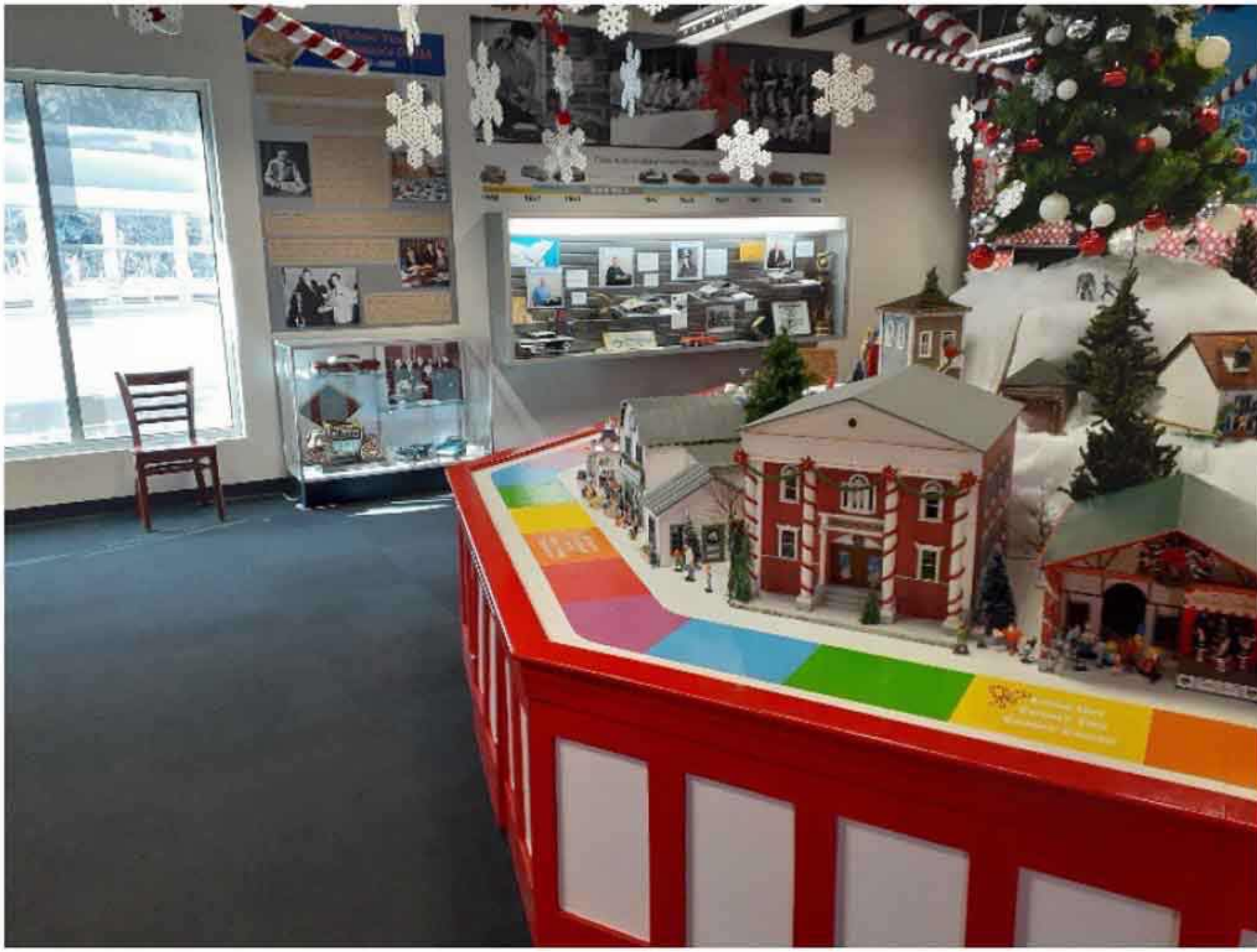
Figure 1. Wall mounted Guild exhibit in background (right) with glass cabinet in background (left) and Santa Claus & Christmas display in foreground.